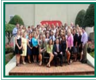
Directors pose outside The Charlotte Marriott Southpark.