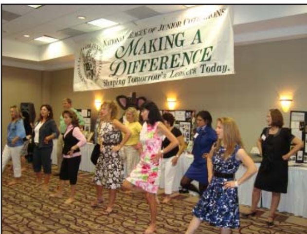
Directors practice a new line dance.