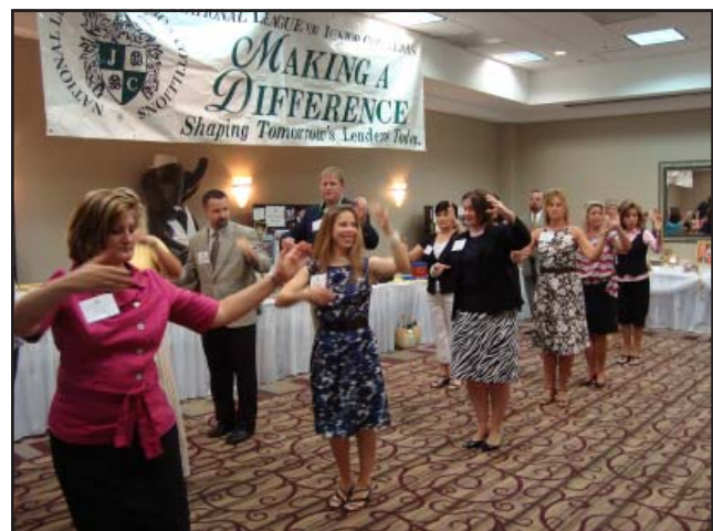
Directors practice form for the Waltz.