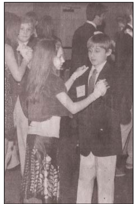
This photograph was featured in an article about NLJC's Fort Mill/Tega Cay Chapter Winter Ball.

“I decided to contact the local television news station about the Winter Ball. I mentioned that this would be a great, feel-good story about middle school students who are happily interested in pursuing a different aspect of their education. The coverage they gave me was wonderful! Because it was a local station, the segment aired ten times between 6:00pm and midnight the Monday following the Winter Ball!”