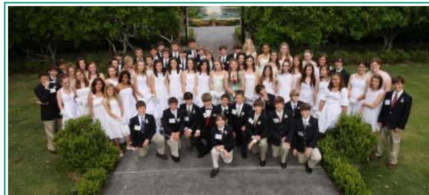
The East Baton Rouge Chapter