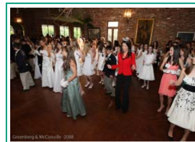
Miss Teen Louisiana enjoys a line dance